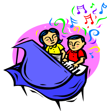
The home teacher at work!